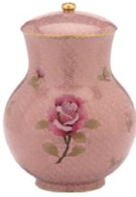
DUSTY ROSE CLOISSONÉ